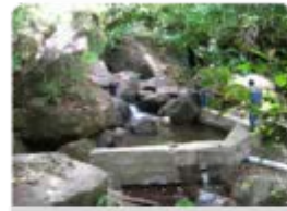
Micro Hydro Power